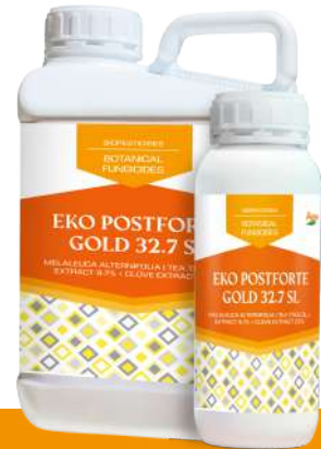
MELALEUCA ALTERNIFOLIA (TEA TREE OIL) EXTRACT 9.7% + CLOVE EXTRACT 23%