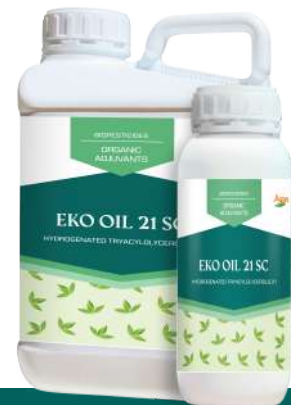
HYDROGENATED TRYACYLGLYCEROLS 21