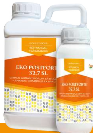
CITRUS AURANTIFOLIA EXTRACT 28.7 % + ANANAS COMOSUS EXTRACT 4.0 %