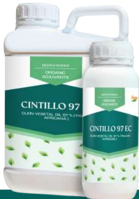
OLEIN VEGETAL OIL 97 % ( PALMA AFRICANA )