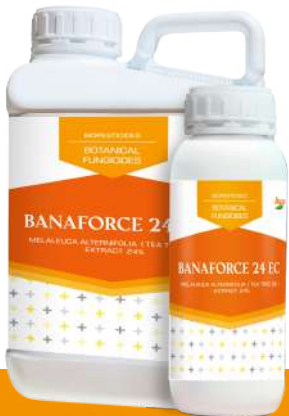
MELALEUCA ALTERNIFOLIA (TEA TREE OIL) EXTRACT 24%