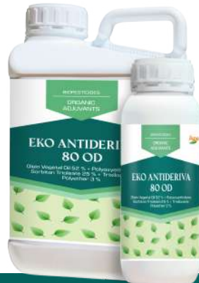
OLEIN VEGETAL OIL 52 % + POLYOXYETHYLENE SORBITAN TRIOLEATE 25 % + TRIXILOXANE POLYETHER 3 %