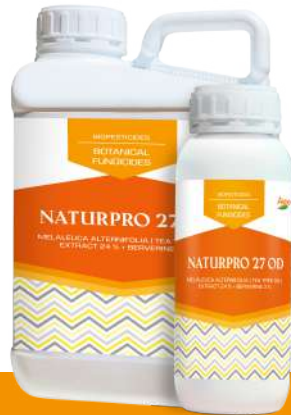
MELALEUCA ALTERNIFOLIA (TEA TREE OIL) EXTRACT 24 % + BERBERINE 3 %