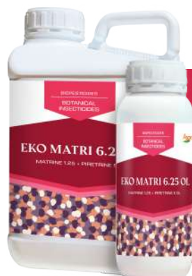
MATRINE 1.25 + PIRETRINE 5 OL