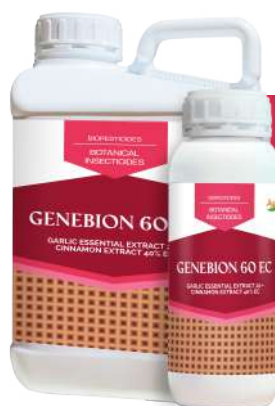
GARLIC ESSENTIAL EXTRACT 20 + CINNAMON EXTRACT 40% EC