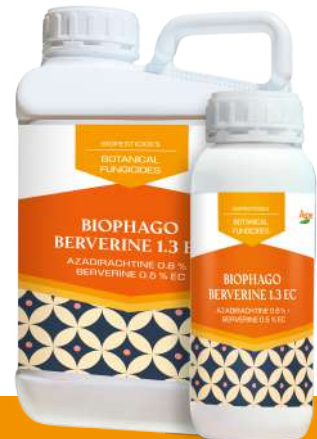
AZADIRACHTINE 0.8 % + BERBERINE 0.5 % EC