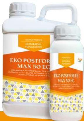
MELALEUCA ALTERNIFOLIA (TEA TREE OIL) EXTRACT 23 % + CLOVE EXTRACT 18 % + CITRUS AURANTIFOLIA EXTRACT 9 %