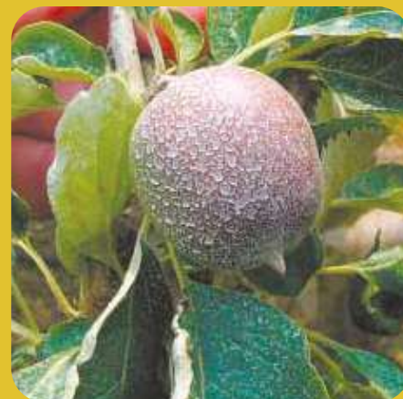
Calcium carbonate-based spray-on sun protection